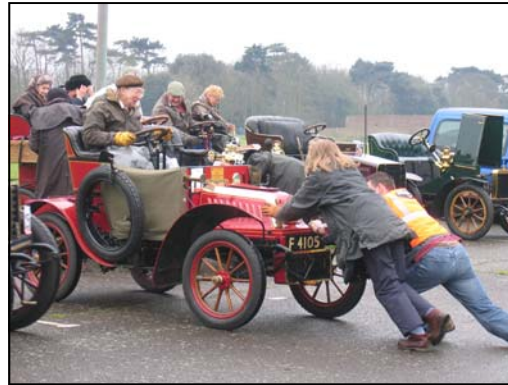
Veteran car day

By the end of this month, it is expected that 50 Oral History interviews will have been completed and the process of putting some of these on our website has begun. Interviewees have generously given photographs and other items of interest. A few of these images are included in this newsletter.