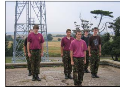
Air Cadets drilling on roof of T-Block

Bawdsey Radar Group could not continue without the help of our volunteers. The Air Cadets from Woodbridge and Leiston have been invaluable. Here is a picture of them drilling on the roof of the Transmitter Block in an off duty moment!