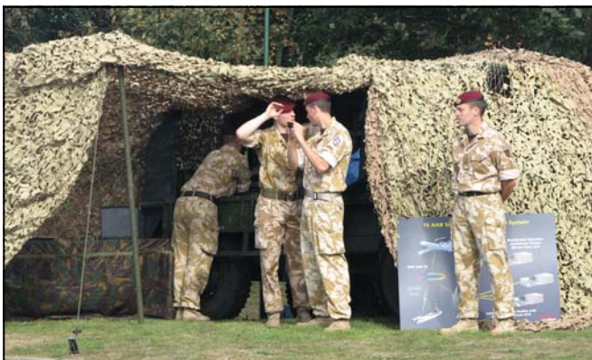
AMRAP Flight 16 Air Assault Brigade