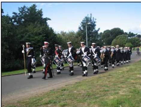
The Band of the Royal Hospital School