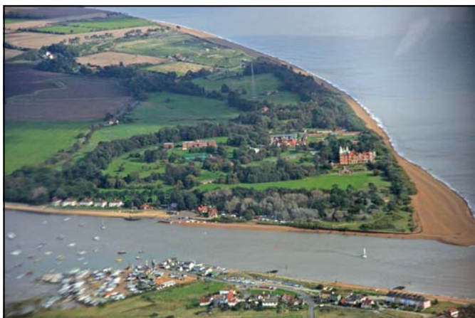
Aerial photograph of Bawdsey Ferry