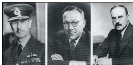
Dowding Watson Watt Tizard