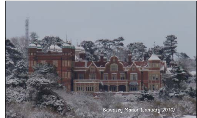
Bawdsey Manor (January 2010)

Bawdsey Radar was formed by a group of local people in 2003. Its aim is to conserve the Transmitter Block and create a permanent exhibition to provide a fitting tribute to the work done at Bawdsey.