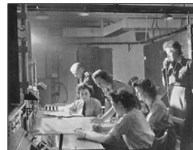
WAAFs at Bawdsey

The team soon required more space for research and development, and in February 1936 Bawdsey Manor Estate was purchased. By the outbreak of World War II in 1939 four 360ft transmitter towers and four 250ft lattice receiving masts had been built, and aircraft could be detected at a distance of 140 miles. By 1941 practically the whole of the British coastline was protected by Chain Home Stations.