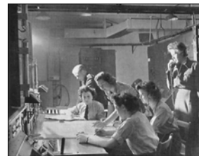
WAAFs at Bawdsey

The team soon required more space for research and development, and in February 1936 Bawdsey Manor Estate was purchased. By the outbreak of World War II in 1939 four 360ft transmitter towers and four 250ft lattice receiving masts had been built, and aircraft could be detected at a distance of 140 miles. By 1941 practically the whole of the British coastline was protected by Chain Home Stations.