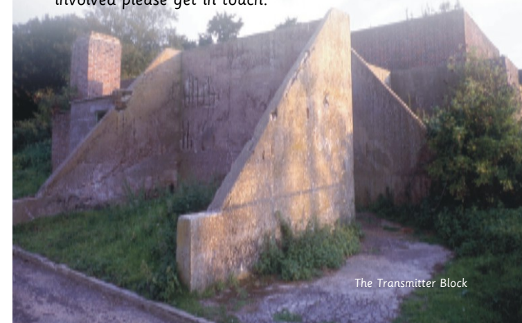
The Transmitter Block

We also always need volunteers. If you would like to be involved please get in touch.