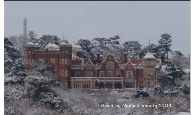
Bawdsey Manor (January 2010)

Bawdsey Radar was formed by a group of local people in 2003. Its aim is to conserve the Transmitter Block and create a permanent exhibition to provide a fitting tribute to the work done at Bawdsey.