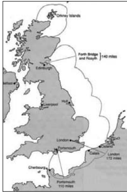
Early Chain Home

Critical to the success enjoyed by the 'few' in their defence of the realm was the role played by Radar stations such as RAF Bawdsey.